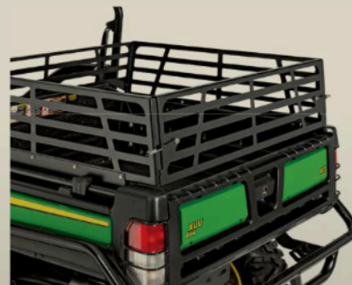
Optional Box Side Extensions increase the amount of light material you can haul such as clippings and mulch when compared to a base model cargo box. Tailgate pivots at the top for ease of unloading loose material.