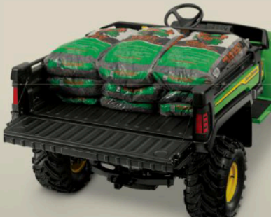
Cargo box has 16.4 cu. ft. (.56 cu. m.) of capacity, a pick-up style tailgate, 20 tie-down points and a gas-assist shock for easier lifting and dumping.