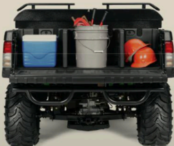
Optional cargo box dividers let you reconfigure and organize your load in a few minutes without tools.